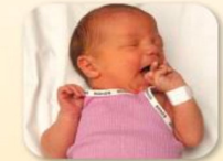
• Hand to mouth

Responding to your baby's behavior, not only gives them security, it also allows them to build their milk supply and gain weight appropriately. Understanding your baby's feeding cues will promote better feedings. Responsive feedings are important for both breast and formula feed babies