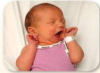
• Mouth opening