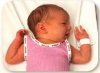
• Turning head • Seeking/rooting