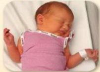
• Increasing physical movement